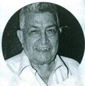
Shri P N Devarajan Endowment lecture