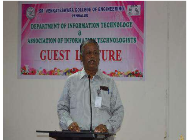
Welcome Address by HOD/IT