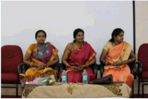
Chief Guest Introduction by AIT Co-ordinator