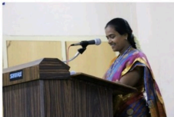
Short Note by HOD-IT