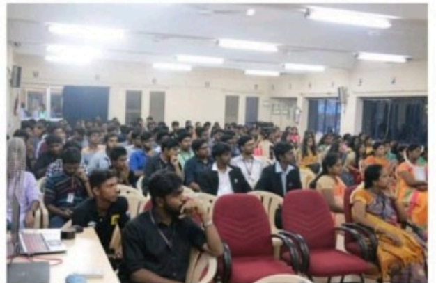
Memento to Chief Guest by HOD-IT