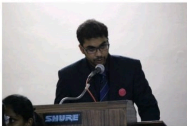
Introduction of Event