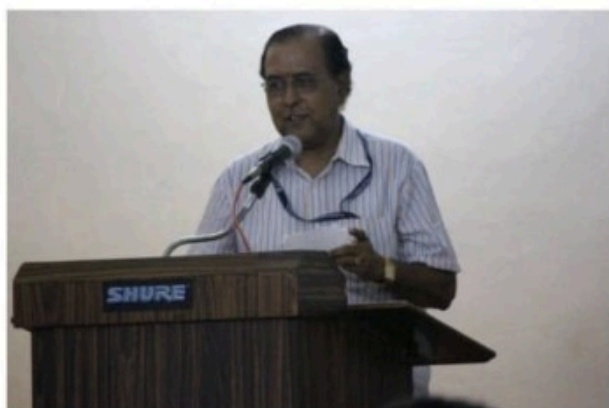
Talk by Chief Guest