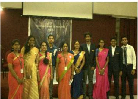
AIT Coordinators and Office Bearers