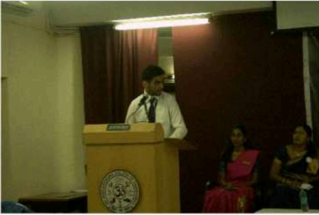
AIT Executive Member – Welcome Address