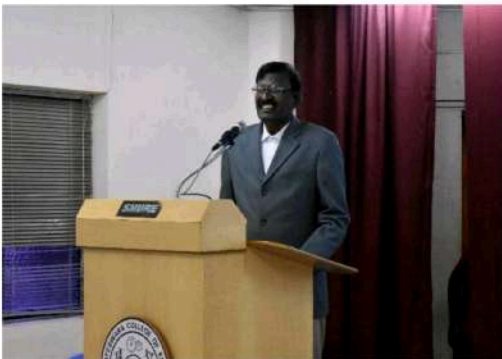
Chief Guest Talk