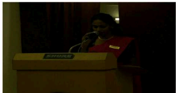
AIT Vice President - Vote of Thanks