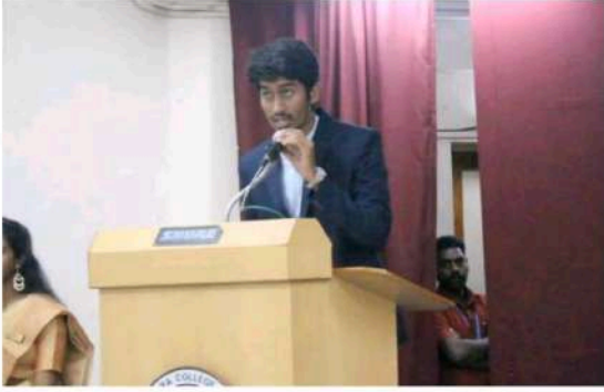
AIT President - Welcome Address