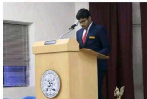
AIT Treasurer – Vote of Thanks