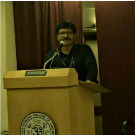
Chief Guest Address