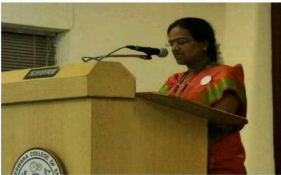
Head I/c IT – Reading annual report