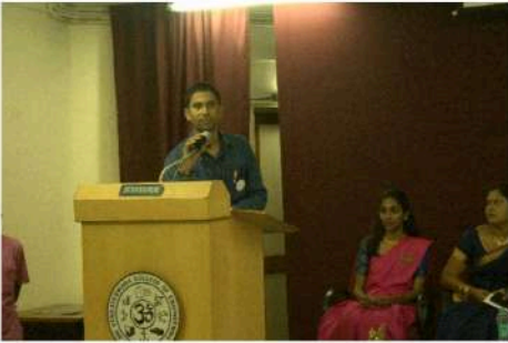
AIT Coordinator –About the symposium