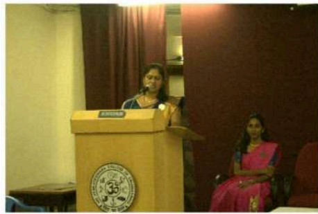
AIT Coordinator –Introduction of CG