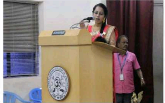
AIT Secretary – Introduction of CG