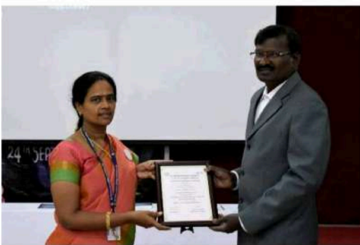
Honoring Chief Guest