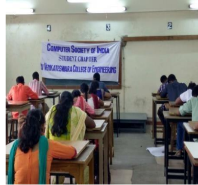
Question paper distribution