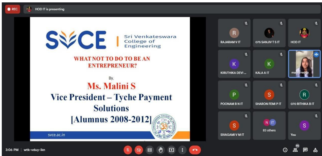
Expert talk by Chief Guest