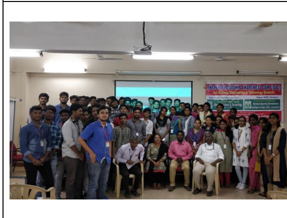
Participants of EAC – III.