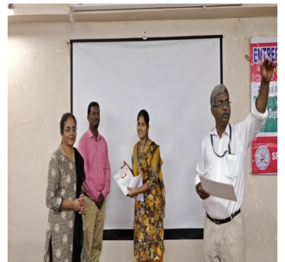
15/02/019: Discussion with Participants