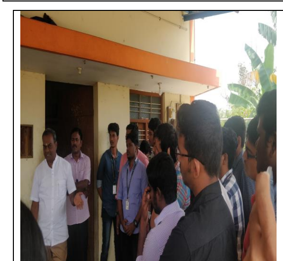
14.2.2019 Session by Entrepreneur