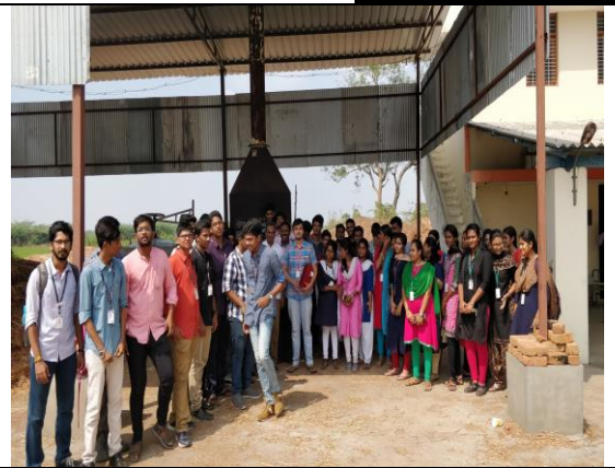
Business/Industrial Visit at Geranoil Company