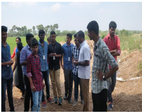
14.02.2019,Business Exposure :- M/S.Venkateswara Chemical Industry.