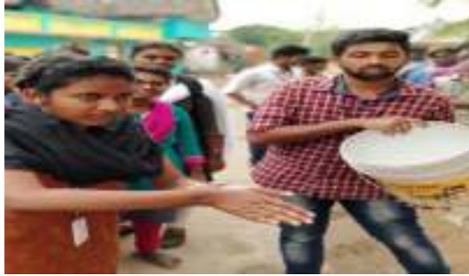
15.03.2018-AN –awareness Rally