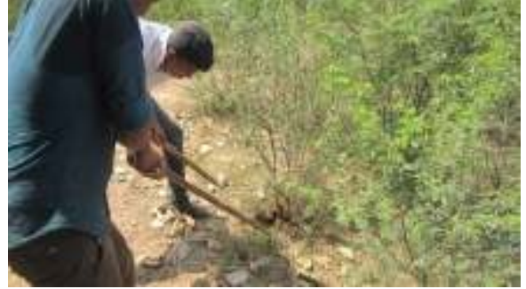
17.03.2018-AN-social work& awareness