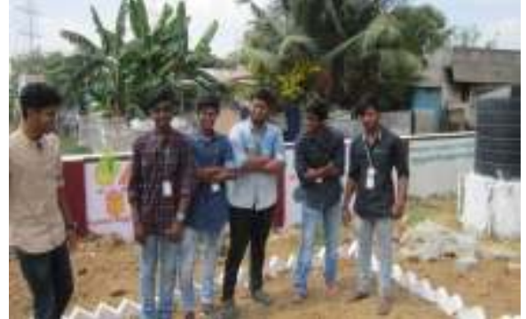
17.03.2018-FN-Drinking water & Sanitation awareness