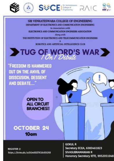
FLYER OF THE EVENTS