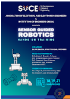
Robotics training program - brochure.png 921K