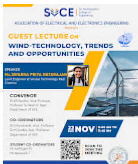
Wind Tech Brochure (1).jpg 628K