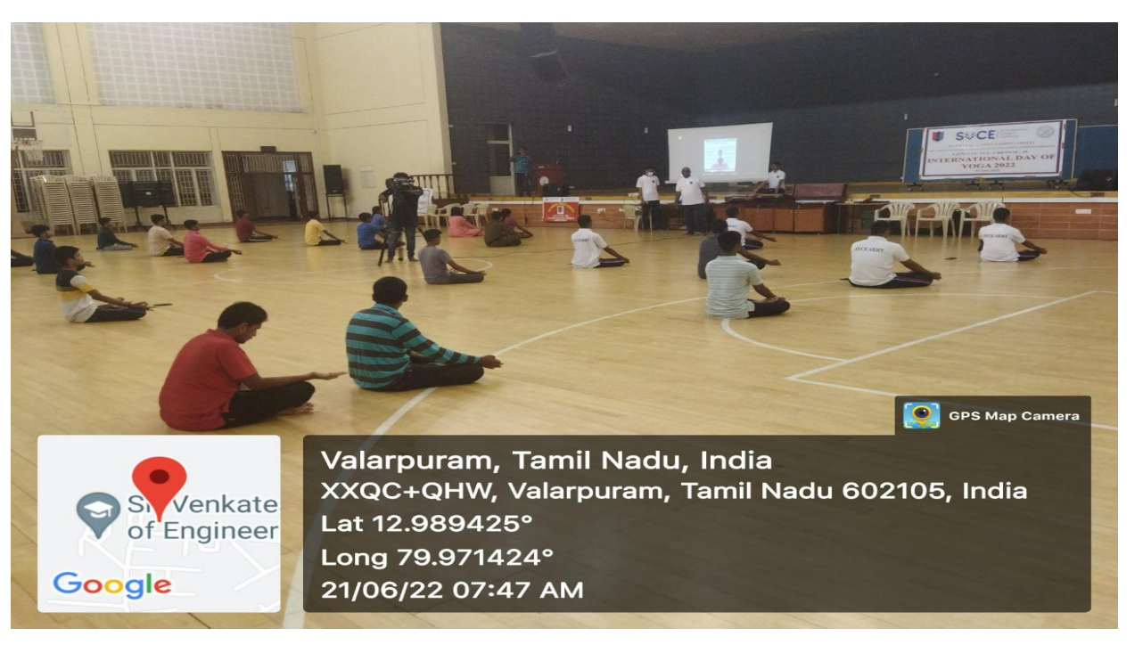
Figure 4. NCC Army Wing Cadets of Sri Venkateswara College of Engineering & Saveetha School of Engineering performing the Yoga Postures.