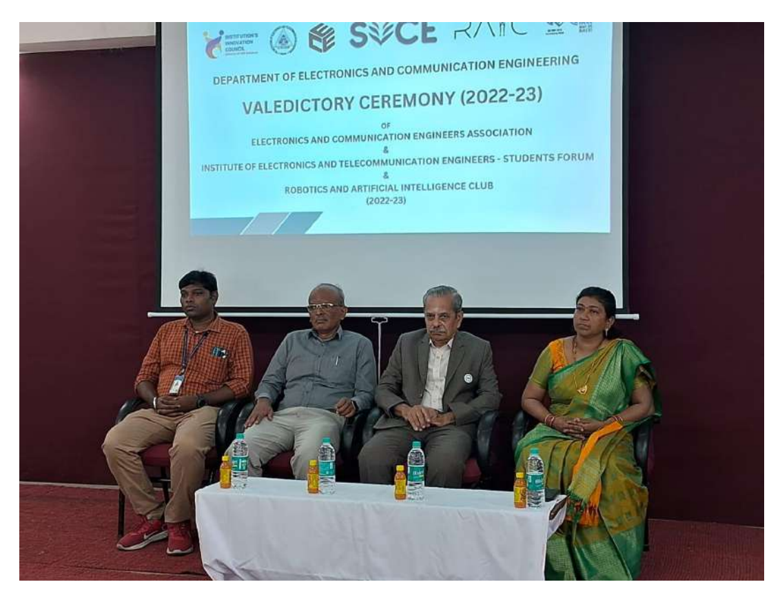
The Chief Guest along with HOD (ECE Dept) & Faculty Co-ordinators of ECEA, IETE-SF & RAIC