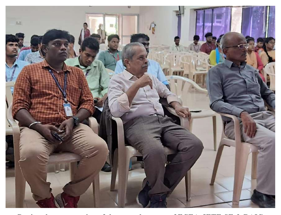
During the presentation of the annual reports of ECEA, IETE-SF & RAIC