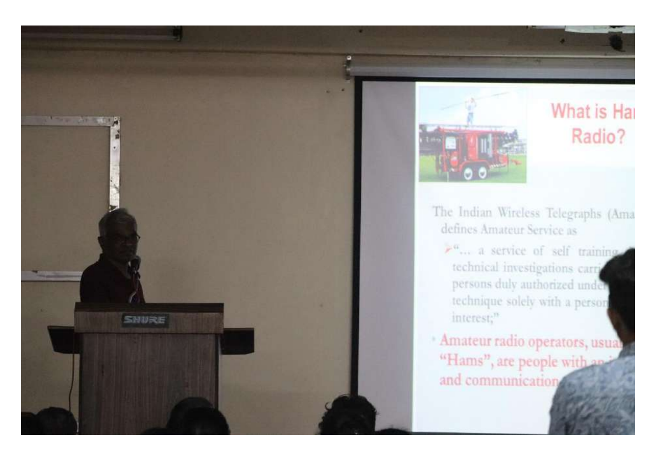
LECTURE ON HAMRADIO TO THE STUDENTS