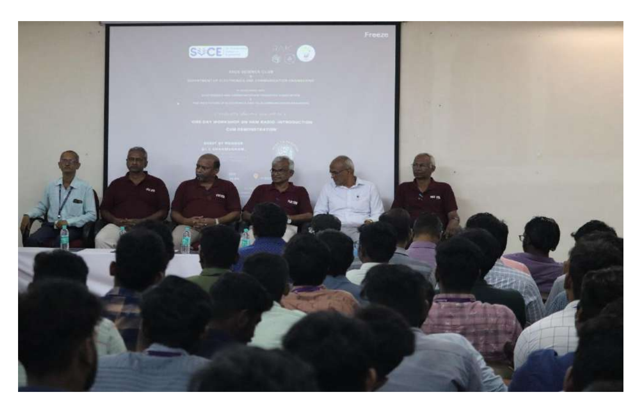
CHIEF GUEST AND CONVENORS OF THE WORKSOP