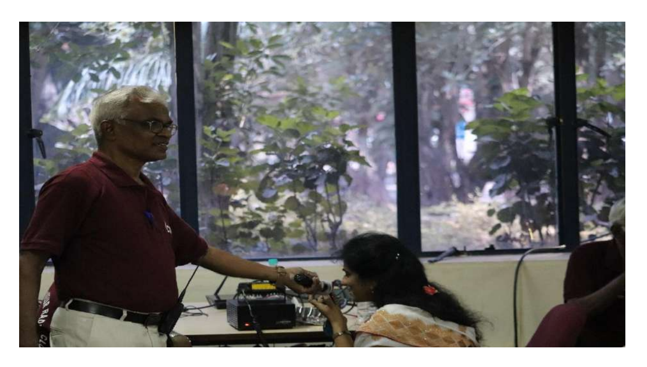
DEMO ON HAM RADIO