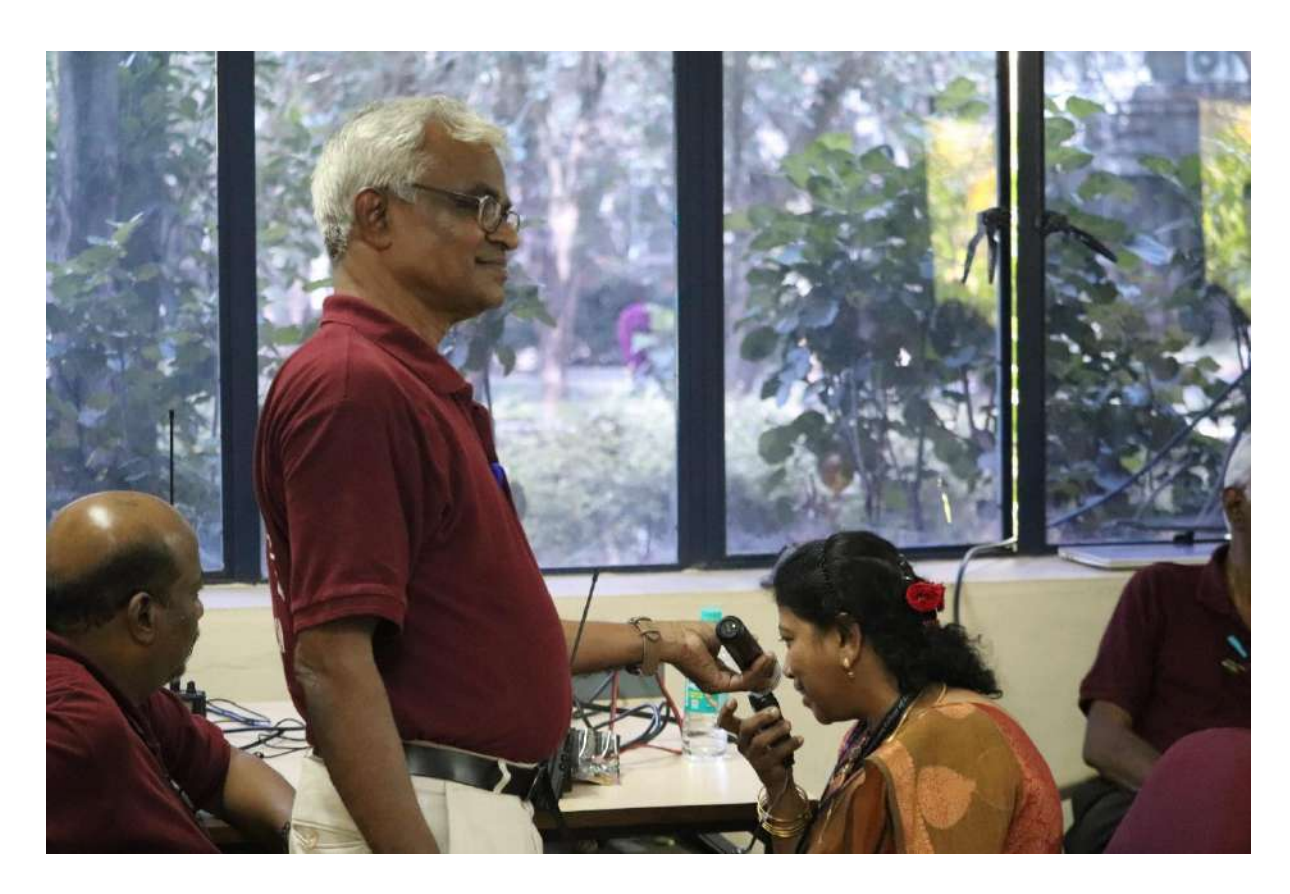
DEMO ON HAM RADIO